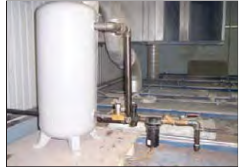
This metered recovery system enhances bag house pulses.