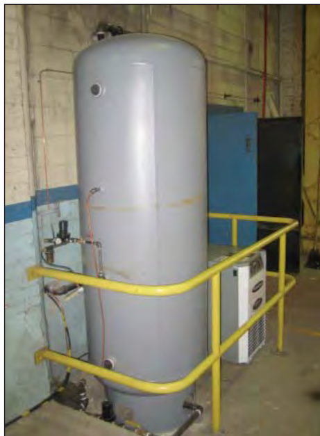
Local storage receivers support pressure caused by intermittent demands.

In this case the same 1,350 scf event can be supplied by stored air, but this time a much smaller storage receiver is required. The compressor would run for less than 18 minutes* to refill the receiver tank and then the system would be ready to supply the next event.